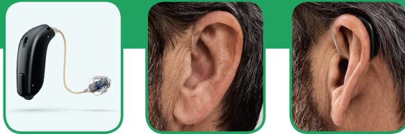
Receiver-in-Canal devices are practically invisible

The thought of wearing a hearing aid can cause many people to feel a little old. While it is common for people to think "I'm still too young for hearing aids" , our clients commonly reflect that they wish they had done something sooner. They actually feel younger and more confident as a result of their returned hearing ability.